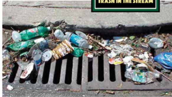
Trash accumulates and clogs a storm drain. Some of this trash will end up in our local waterways.

There are some small changes we can make so these items don't end up in our waterways.